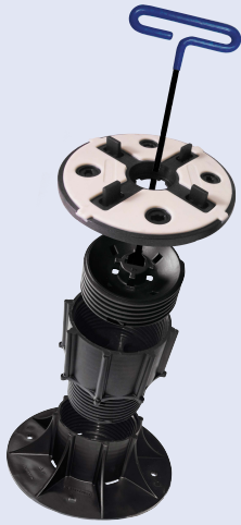
ETERNO ADJUSTABLE PAVING SUPPORT WITH SELF LEVELING HEAD