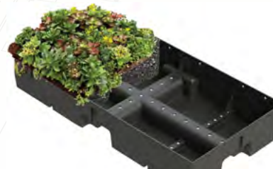
VISTA 6" GREEN ROOF TRAY